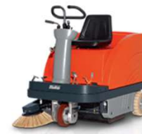
Sweepmaster 900 R up to 7 200 m 2 /h