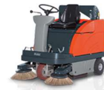
Sweepmaster 980 R up to 7 200 m 2 /h