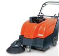
Sweepmaster 650 up to 3 525 m 2 /h