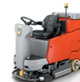
Scrubmaster B175 R up to 7 560 m 2 /h