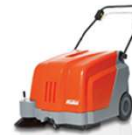
Sweepmaster B500 up to 2 400 m 2 /h