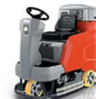
Scrubmaster B120 R up to 5 800 m 2 /h