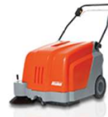
Sweepmaster B500 up to 2 400 m 2 /h