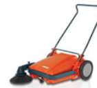
Sweepmaster M600 up to 2 300 m 2 /h