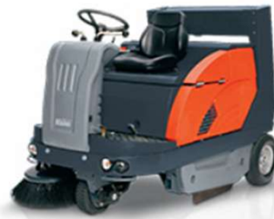
Sweepmaster 1200 RH up to 13 200 m 2 /h