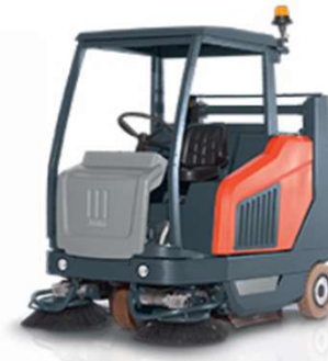
Sweepmaster 1500 RH up to 14 580 m 2 /h