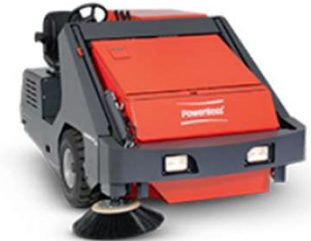
PowerBoss Armadillo 9XR up to 25 100 m 2 /h

The spectrum ranges from particularly compact and manoeuvrable machines to universal models providing a cleaning performance of up to over 16,000 m 2 /h. Hako Sweepmaster models meet the highest demands in terms of cost-effective application.