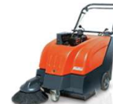
Sweepmaster 650 up to 3 525 m 2 /h