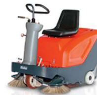
Sweepmaster B800 R up to 6 600 m 2 /h