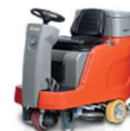
Scrubmaster B75 R up to 3 500 m 2 /h