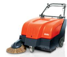
Sweepmaster 800 up to 4 350 m 2 /h

Hako walk-behind and ride-on machines provide excellent performance in terms of economic efficiency and user-friendliness and have been designed with much attention to detail.