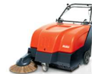
Sweepmaster 800 up to 4 350 m 2 /h